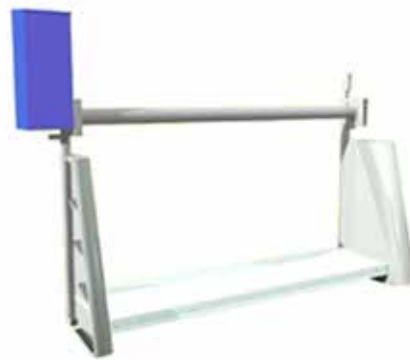
OPEN GATE - UPSTREAM VIEW