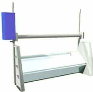
CLOSED GATE - UPSTREAM VIEW