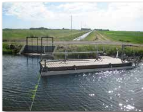
Plan A: SMRID East Lateral

Aqua Systems 2000 has developed a floating dock trash deflector that can be a cost-effective addition to tools for managing and disposal of water weeds, algae and other debris that floats down canals and interferes with water management. A large percentage of the debris in a canal is floating on the surface or suspended in the top two or three feet of depth. The floating dock and screen positioned at an angle across the canal effectively re-directs this debris with virtually no effect on the normal water flow in the canal. Removing or diverting this debris from the canal can have major benefits to other downstream screening devices and water users.