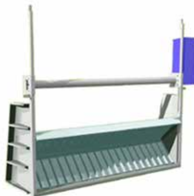
CLOSED GATE - DOWNSTREAM VIEW